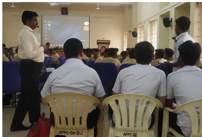
Corporate Trainer Discussing About the Program with Our III Year Student