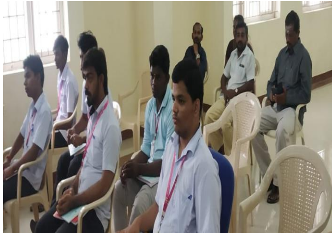
Students And Staff Members attended the Carrier Guidance Program